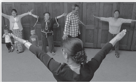
Participants enjoy group exercise during a diabetes prevention class.

Diabetes continues to be a rising national health crisis. The fastest growing cases of diabetes are among Asian American and Pacific Islanders (AAPIs) and Hispanic adults. In Northeast Ohio, it is estimated that nearly 3,000 people within the AAPI community are living with diabetes. Each of these communities have unique socio-economic, historical, cultural, and linguistic factors that attribute to their higher risk for diabetes.