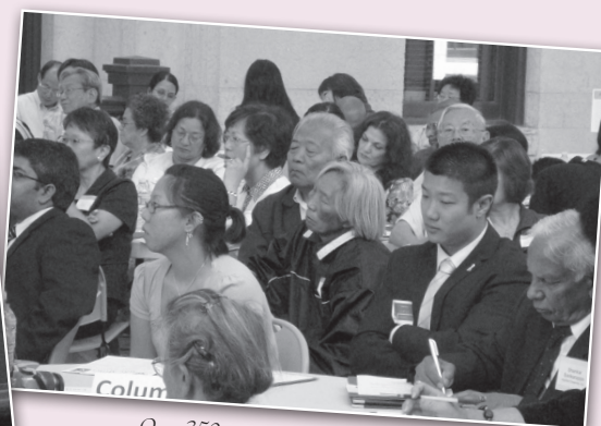
Over 350 participants from across the state were in attendance on June 8.