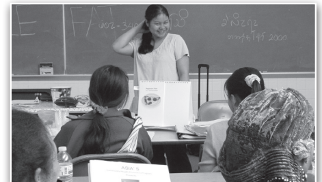
A community health worker teaches the class.

What is needed for further prevention is greater outreach to AAPI communities about the role nutrition and lifestyle play in health and diabetes. Mainstream health providers also need greater awareness about culturally specific needs of AAPIs. Combined, these efforts can help stop the spread of type 2 diabetes.